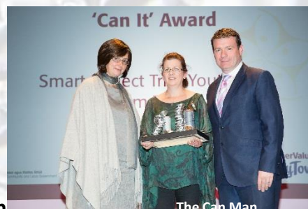
Trim, Co. Meath