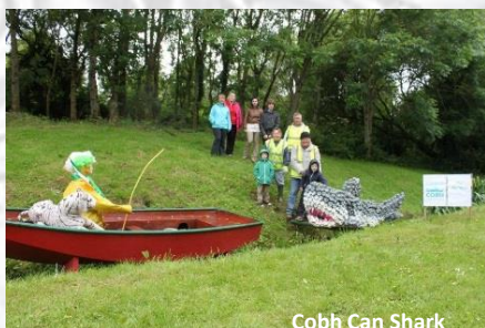
Cobh, Co. Cork